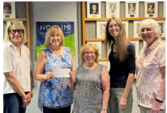
Bookstock Representatives deliver NCJW|MI Proceeds from the sale