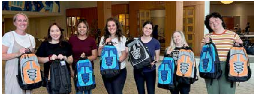
Backpack Project JFS Representatives