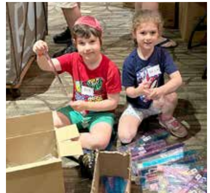
Backpack Project Youngest volunteers