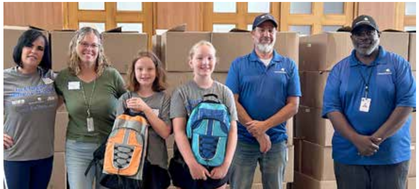
Backpack Project Oakland Schools representatives