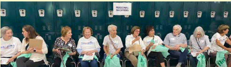
NCJW | MI volunteers waiting for the next group of kids to arrive