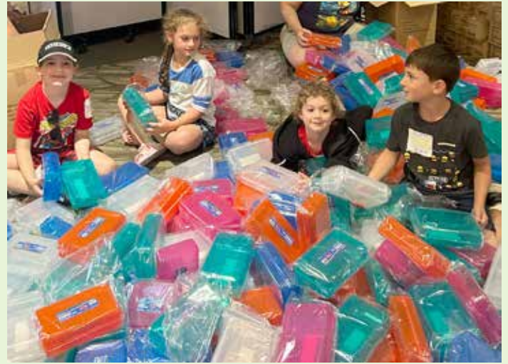
Future NCJW | MI volunteers and supporters