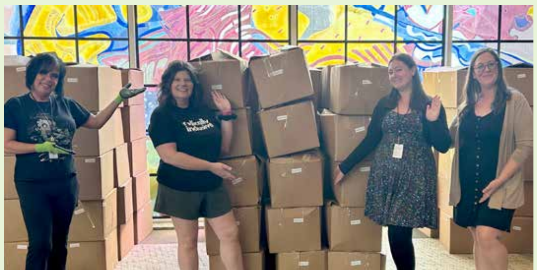
Oakland Schools representatives picking up boxed backpacks filled with school supplies