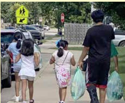
Families leave with bags full of school supplies and new clothes