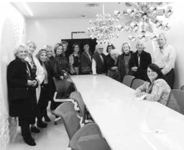
OUT & ABOUT-QUICKEN LOANS TOUR

A great gift idea for those who want to be a part of a wonderful organization. Offer good through December 31, 2016.