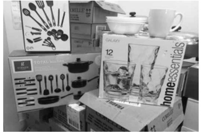
Luggage for Freedom household essentials