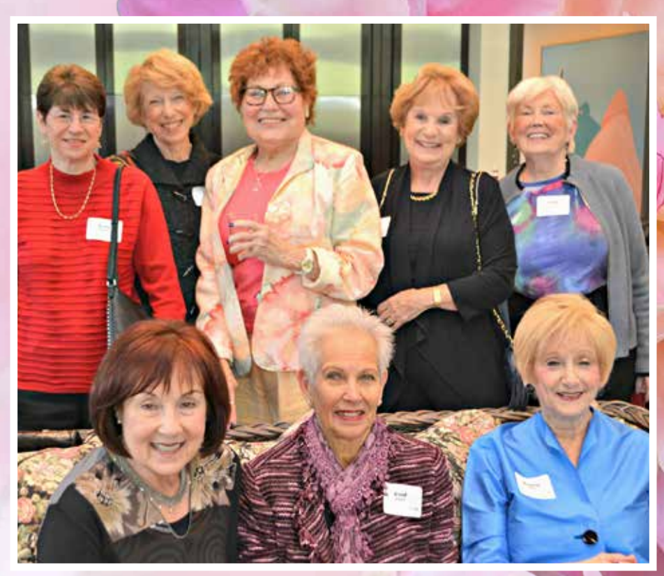
125th Anniversary High Tea 2016