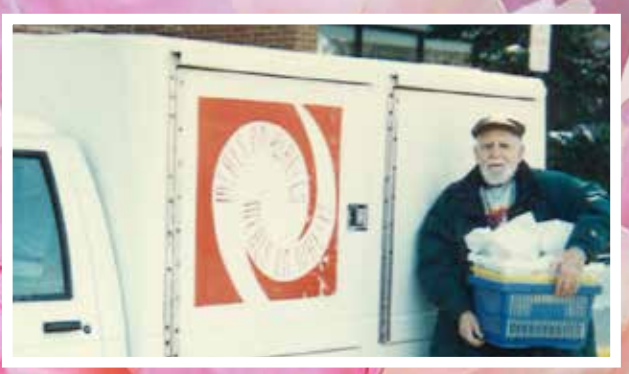
Meals on Wheels 1992